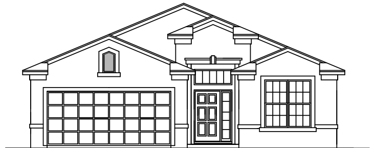
Front Elevation B