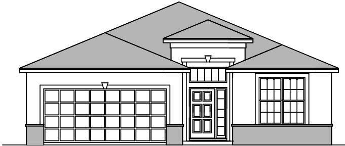
Front Elevation A